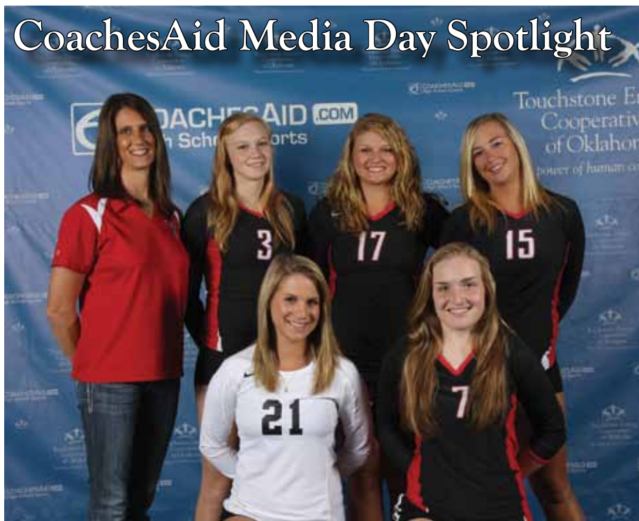
2011 Verdigris High School Girls Volleyball Team

Verdigris High School girls volleyball team was VVEC's delegate to the 2011 CoachesAid Media Day event held at Northeastern State University, Tahlequah.